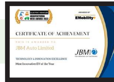
Most Innovative EV of the year- 'Technology & Innovation Excellence' by E-Mobility+ Media Group