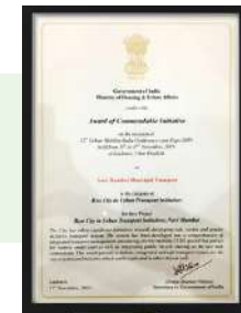
Best City in Urban Transport Initiatives - Navi Mumbai