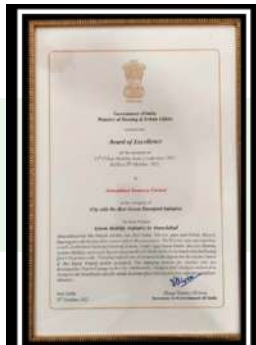
Best Green Transport Initiative, Ahmedabad Janmarg Limited