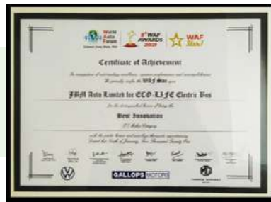
JBM Auto Limited for ECO-LIFE Electric Bus